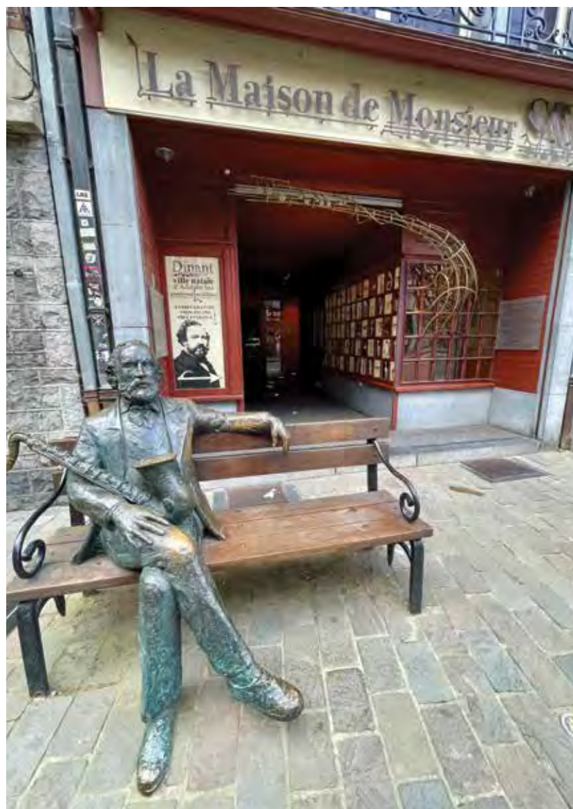
Adolphe Sax, in front of his home

Right out of a fairytale, the spectacular Château de Walzin in Dréhance, a sub-municipality of Dinant, is just 8km south. The Château de Vêves in Furfooz National Park and Château Royal d'Ardenne in Houyet, both 10-15km south of Dinant, are other