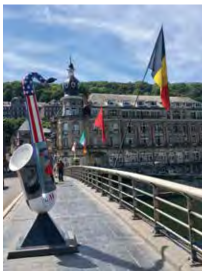
Top: Brass footprint. Above left: Collegiate Church stained glass. Above right: Saxophone sculpture. Previous pages: the citadel and river front