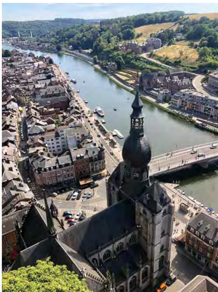
View from the citadel

Vergers et Ruchers Mosans: Offers products from a local orchard and beehive