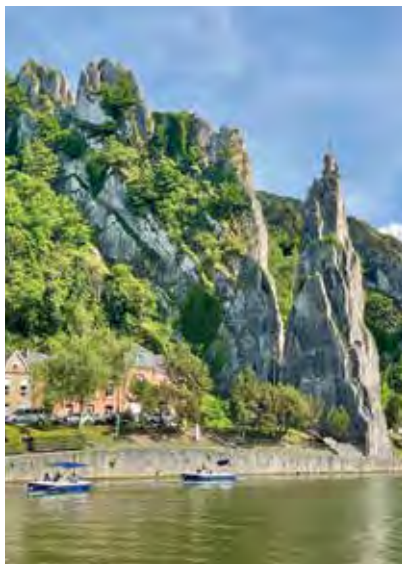
Left: Maison Leffe. Right: Rocher Bayard

“ South of Dinant are several natural wonders, including the Grotte La Merveilleuse cave in Philippeville, Les Aiguilles de Chaleux (Needle Rocks) in Houyet and Furfooz Nature Reserve and Park. ”